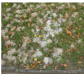
C. hederæ nests

The bees are harmless and completely safe with children and pets