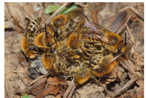
Mating cluster of Colletes hederæ