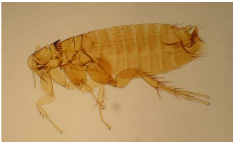
Ctenophthalmus nobilis vulgaris ♂

Antoni van Leeuwenhoek (Father of Siphonapterology) Delft, 15 October 1693