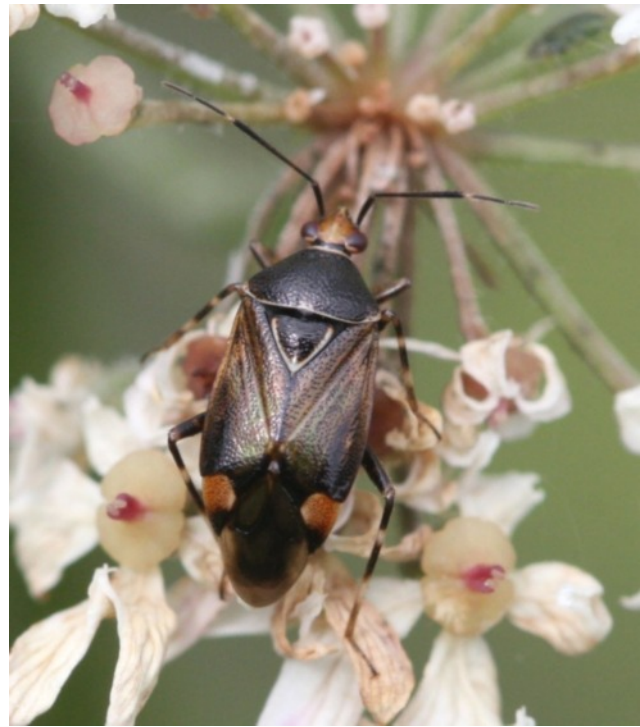
Deraeocoris flavilinea.

Another plant bug which has established itself in our region in less than a decade is Deraeocoris flavilinea . This appeared to have made its presence simultaneously in Leicestershire, Derbyshire,