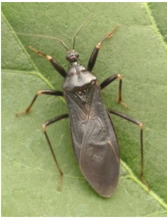
Reduvius personatus .

southern species but is occasionally recorded from the Midlands. The older records only give one report for VC55; Market Harborough in 1949 but two more records were received in 2015. An adult female was attracted to a moth light trap near Buckminster, Colsterworth (Adrian Russell) and an adult was reported from a garden